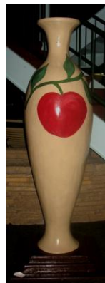
Watt Style 7' Auction Pot