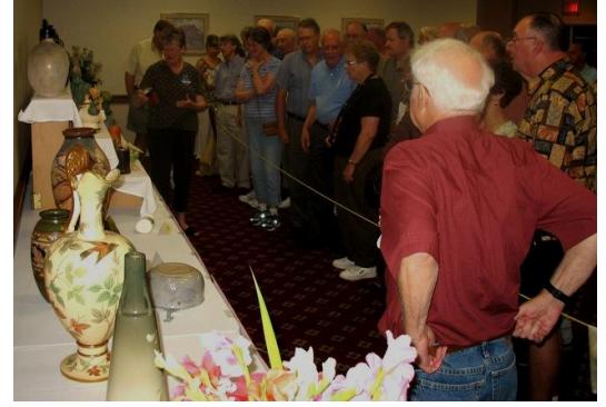
2008 Mixer Party Show & Tell

We had a great reunion this year! For those of you who missed it, you are in for some surprises! For years we've been considering different, better, and more constructive ways to structure the Reunion, enabling as many people as possible to attend. We've all been a participant in a discussion, somewhere along the way about the reunion spreading out over two weeks, forcing many in our group to choose between the first week, the second week, and confusing newcomers completely.