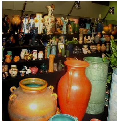
2008 Show Pots