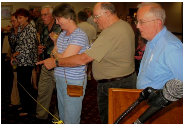
Show & Tell 2008